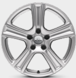
Alloy wheel 17" Suwon 17" 5-spoke alloy wheel, silver, 7.0Jx17, suitable for 235/65 R17 tyres. For Sorento MY18 applicable only for vehicles with 17" original wheel from the factory. C5400ADE00