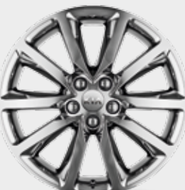
Alloy wheel kit 19" 19" 10-spoke alloy wheel, chrome finish, 7.5Jx19, suitable for 235/55 R19 tyres. Kit includes a cap and five nuts. C5F40AK350