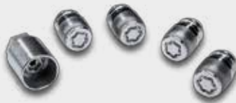
Locking wheel nuts and key Protect your style investment with this set of locking wheel nuts. 66490ADE50 (medium)