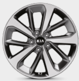
Alloy wheel kit 18", type-C 18" alloy wheel, 7.5Jx18, suitable for 235/60 R18 tyres. Kit includes a cap and five nuts. C5F40AK610