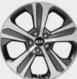
Alloy wheel kit 19", type-D 19" alloy wheel, 7.5Jx19, suitable for 235/55 R19 tyres. Kit includes a cap and five nuts. C5F40AK710