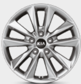
Alloy wheel kit 17", type-B 17" alloy wheel, 7.0Jx17, suitable for 235/65 R17 tyres. Kit includes a cap and five nuts. For Sorento MY18 applicable only for vehicles with 17" original wheel from the factory. C5F40AK510