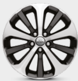
Alloy wheel kit 18" 18" 10-spoke alloy wheel, bi-colour, 7.5Jx18, suitable for 235/60 R18 tyres. Kit includes a cap and five nuts. C5F40AK230