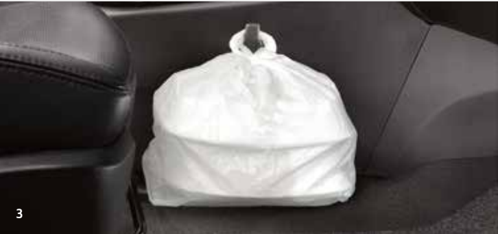
3. Take away hook Mounted on the lower passenger side of the centre console, the hook secures bags containing food & drink "to go", to reduce the chance of any spillage while on the move. Reference picture. 66743ADE00