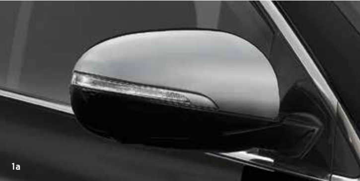
1. Door mirror caps Eye-catching high gloss and brushed stainless steel mirror caps complement other bright styling elements. 1a. C5431ADE10ST (brushed) 1b. C5431ADE00ST (chrome optic)