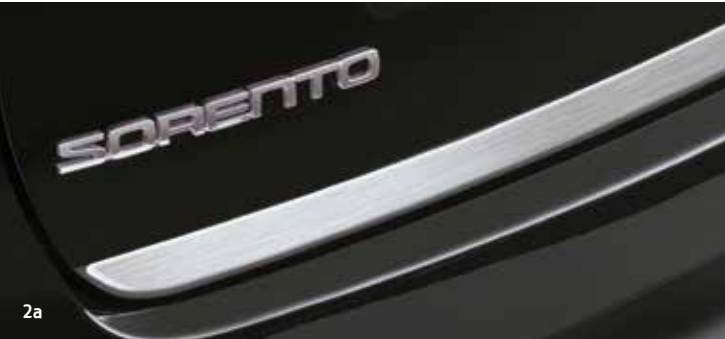
2. Tailgate trim line This made-to-measure high gloss and brushed stainless steel trim adds a stylish finishing touch to the tailgate. 2a. C5491ADE10ST (brushed) 2b. C5491ADE00ST (chrome optic)