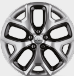
Alloy wheel kit 19" 19" 5-Y-spoke alloy wheel, bi-colour, 7.5Jx19, suitable for 235/55 R19 tyres. Kit includes a cap and five nuts. C5F40AK330