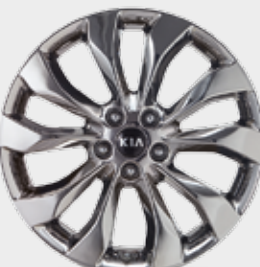
Alloy wheel kit 19", type-E 19" alloy wheel, 7.5Jx19, suitable for 235/55 R19 tyres. Kit includes a cap and five nuts. C5F40AK810