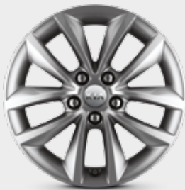
Alloy wheel kit 17" 17" 5-double spoke alloy wheel, 7.0Jx17, suitable for 235/65 R17 tyres. Kit includes a cap and five nuts. For Sorento MY18 applicable only for vehicles with 17" original wheel from the factory. C5F40AK110