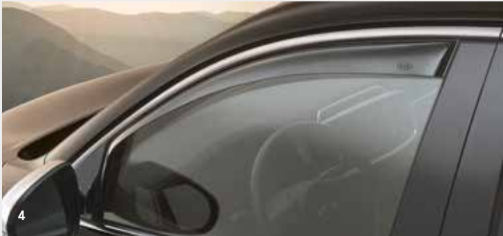
4. Wind deflectors Reduces turbulence when driving with a slightly open front window. The aerodynamically formed deflector redirects the airflow and deflects the raindrops. Set of 2. C5221ADE00 (MY15)